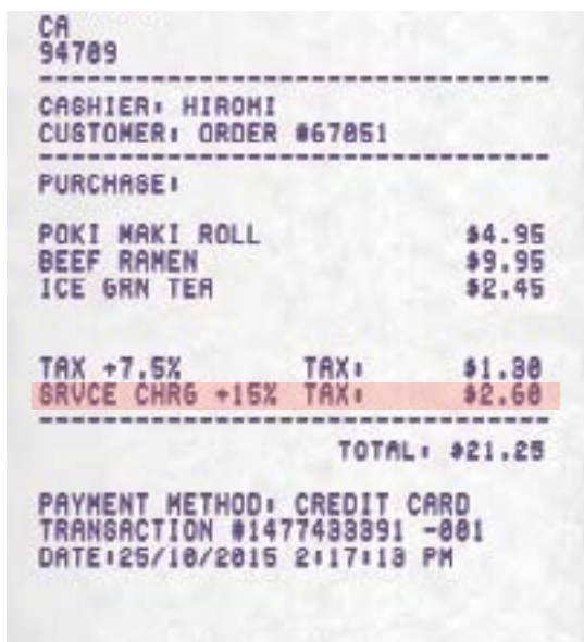
Example of receipt with added service charge.

Even with a $15 minimum wage, many workers in the restaurant industry will still rely heavily on tips or, increasingly, on “service charges” in order to attain a living wage. 4 A service charge differs from a tip, as it is an obligatory fee included on the customer’s bill. 5 Under federal law, tips are considered a worker’s property, while service charges are considered an employer’s property. Restaurant patrons may assume the service charge is equivalent to a tip, but their money may not reach workers as intended or at all, as service charges are non-tip income to distribute as the employer sees fit, or keep entirely. 6