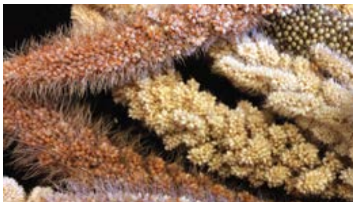
Millet varieties.

Millets are a grain family that is gluten-free, lower in carbohydrates, and higher in protein, fiber, and minerals than most other grains.