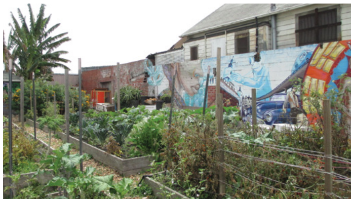
People's Grocery California Hotel.