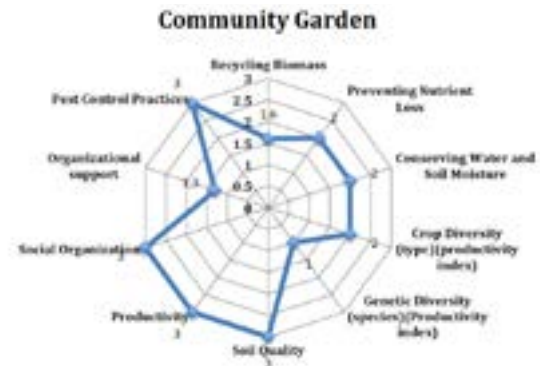
Community Garden “rating” system.

the targeted 10 kg/m 2 of productivity (established by our team based on production levels reached by intermediate Cuban urban farms) and demonstrates the potential for increased yields in Bay Area urban agriculture with additional research, outreach, and institutional support. Low yields seemed associated with bad choice of crops, poor management, and low levels of crop diversity. A large number of heavy, high-producing crops (tomato, squash, and strawberry) resulted in high estimated productivity and are hypothesized to be a large factor in the variation seen in the data.