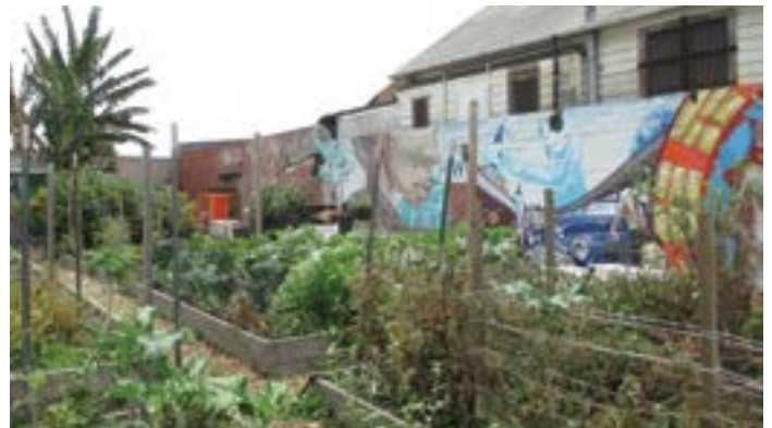
People's Grocery California Hotel.